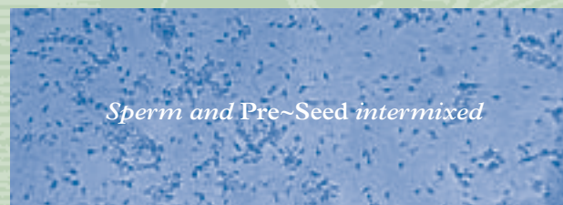
Sperm in Pre~Seed are able to move freely through both the semen and the Pre~Seed moisturizer.

* Picture taken in laboratory at 20X magnification.