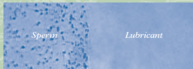
Popular lubricants can create a barrier that interferes with sperm.

The pictures below illustrate the sperm-friendly environment Pre~Seed provides.*